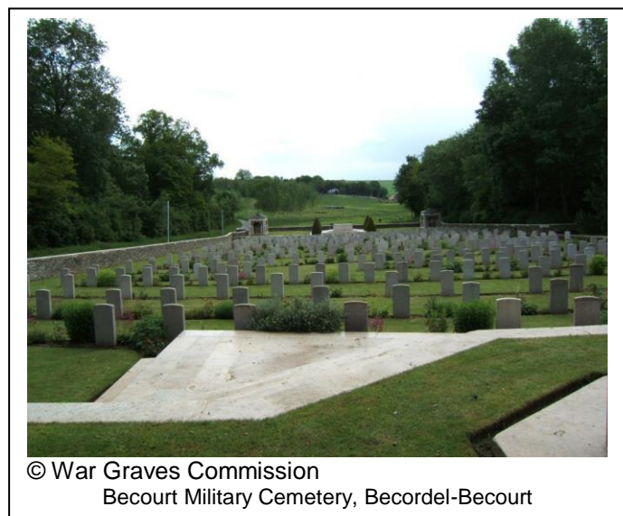
Becourt Military Cemetery, Becordel-Becourt

The cemetery covers an area of 4,327 square metres and is enclosed by a rubble wall.