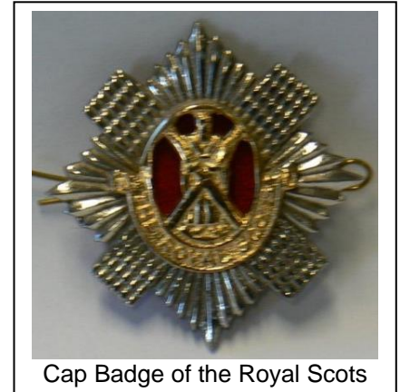
Cap Badge of the Royal Scots

The 1901 census shows that he was still living in Drumyeonmore on Gigha or Cara. At this time he was an 8 year old scholar living with both of his parents and siblings.